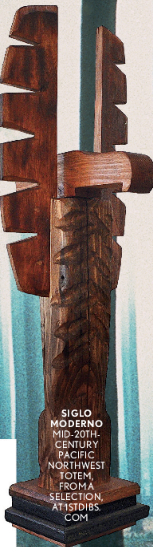
SIGLO MODERNO MID-20TH- CENTURY PACIFIC NORTHWEST TOTEM, FROM A SELECTION, AT 1ST DIBS. COM